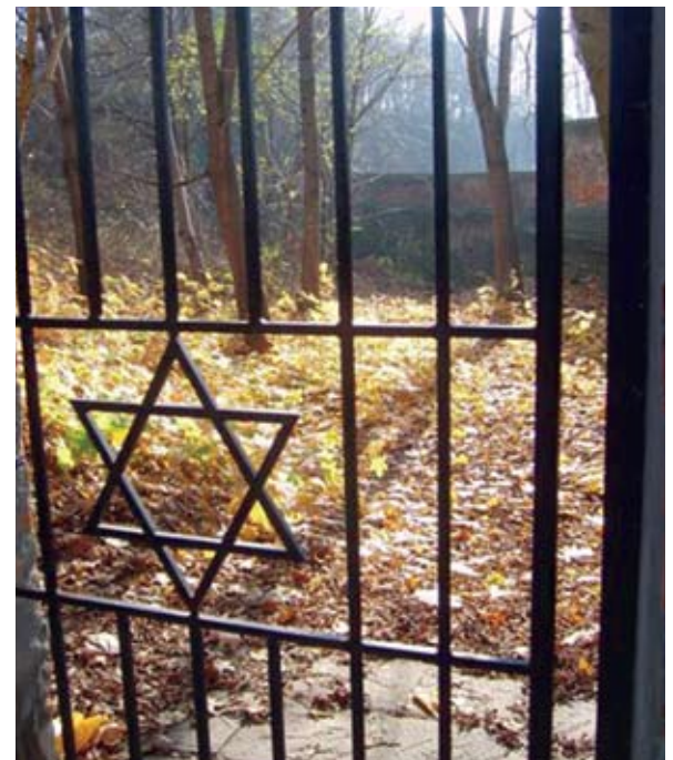
Above: A Jewish cemetery in Lublin

In short, I cannot encourage students enough to study abroad. This is a wide and wonderful world we live in, with rich and diverse cultures which can only be fully experienced first-hand. There are lessons to be learned and people to meet! Of course, I can only speak from my own biased perspective, but I highly recommend Poland as a potential destination!