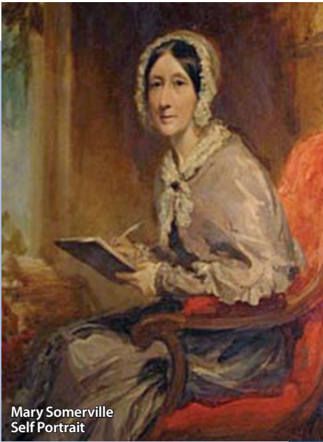
Mary Somerville Self Portrait