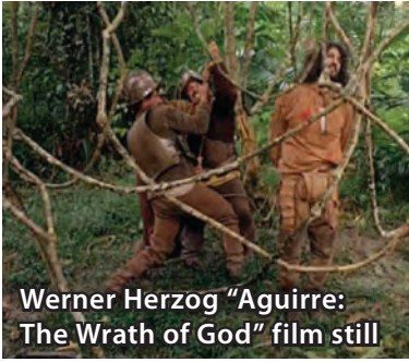
Werner Herzog "Aguirre: The Wrath of God" film still